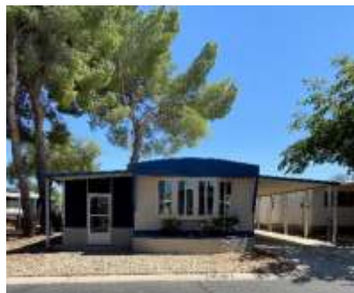
Lot 104 2 Bed/1 Bath $27,500.00

3411 South Camino Seco • Tucson, AZ 85730 Office: 520-885-5251 • Facsimile: 520-885-2355 www.rinconcountrymobilehomepark.com