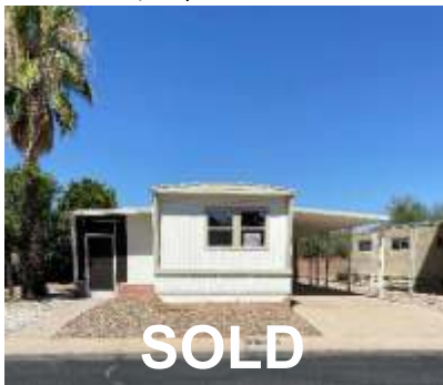
Lot 333 2 Bed/2 Bath $19,999.00