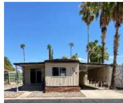
Lot 208 2 Bed/1 Bath $18,999.00