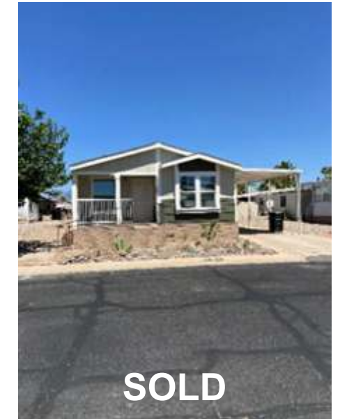
Lot 386 3 Bed/2 Bath $110,000.00