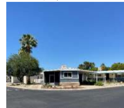
Lot 345 2 Bed/1 ½ Bath $26,999.00