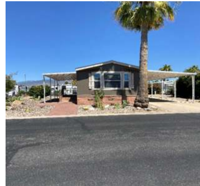
Lot 116 2 Bed/2 Bath $87,000.00