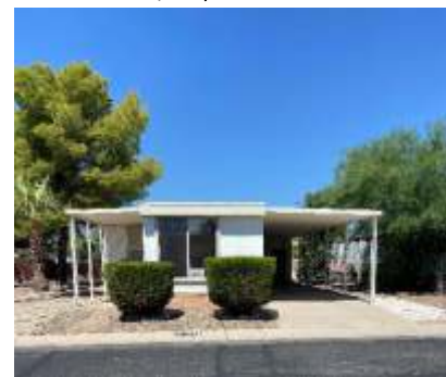
Lot 338 2 Bed/2 Bath $17,999.00