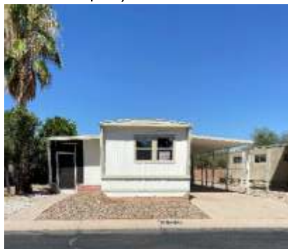
Lot 333 2 Bed/2 Bath $19,999.00