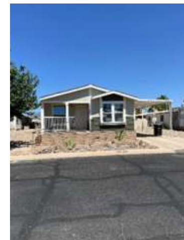
Lot 386 3 Bed/2 Bath $110,000.00