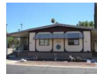
# 503 $16,000