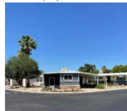
Lot 345 2 Bed/1 ½ Bath $26,999.00