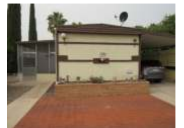
# 306 $40,000