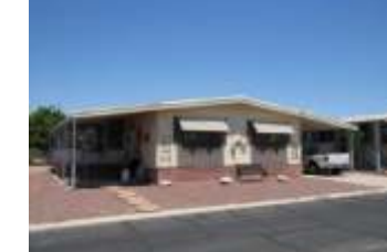
# 357 Pending