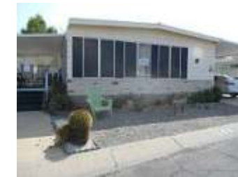
# 294 SOLD