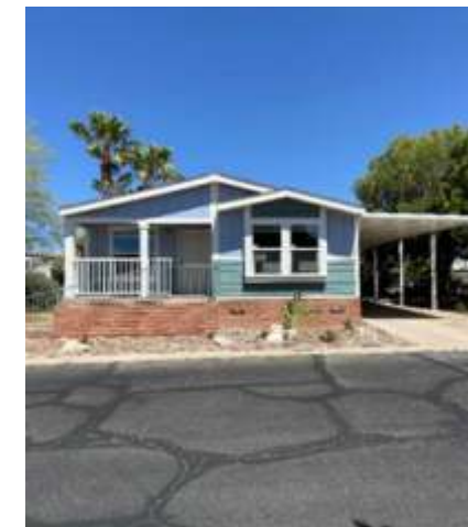
Lot 151 3 Bed/2 Bath $110,000.00