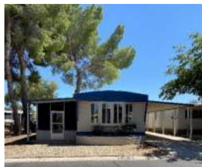
Lot 104 2 Bed/1 Bath $27,500.00

3411 South Camino Seco ▪ Tucson, AZ 85730 Office: 520-885-5251 ▪ Facsimile: 520-885-2355 www.rinconcountrymobilehomepark.com