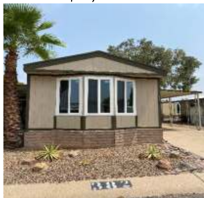
Lot 382 3 Bed/2 ½ Bath $34,999.00