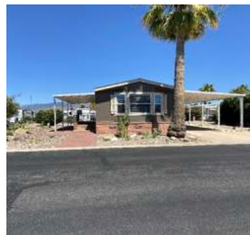
Lot 116 2 Bed/2 Bath $87,000.00