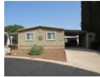
# 179 SOLD