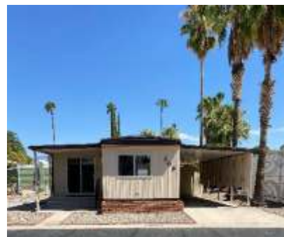
Lot 208 2 Bed/1 Bath $18,999.00