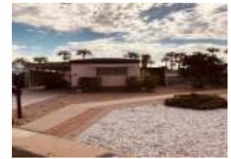
# 109 SOLD