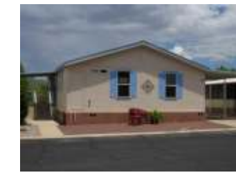
# 536 $39,500