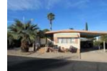
# 235 SOLD