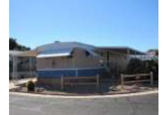
# 216 Pending