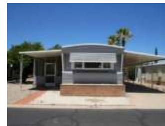
# 146 Pending