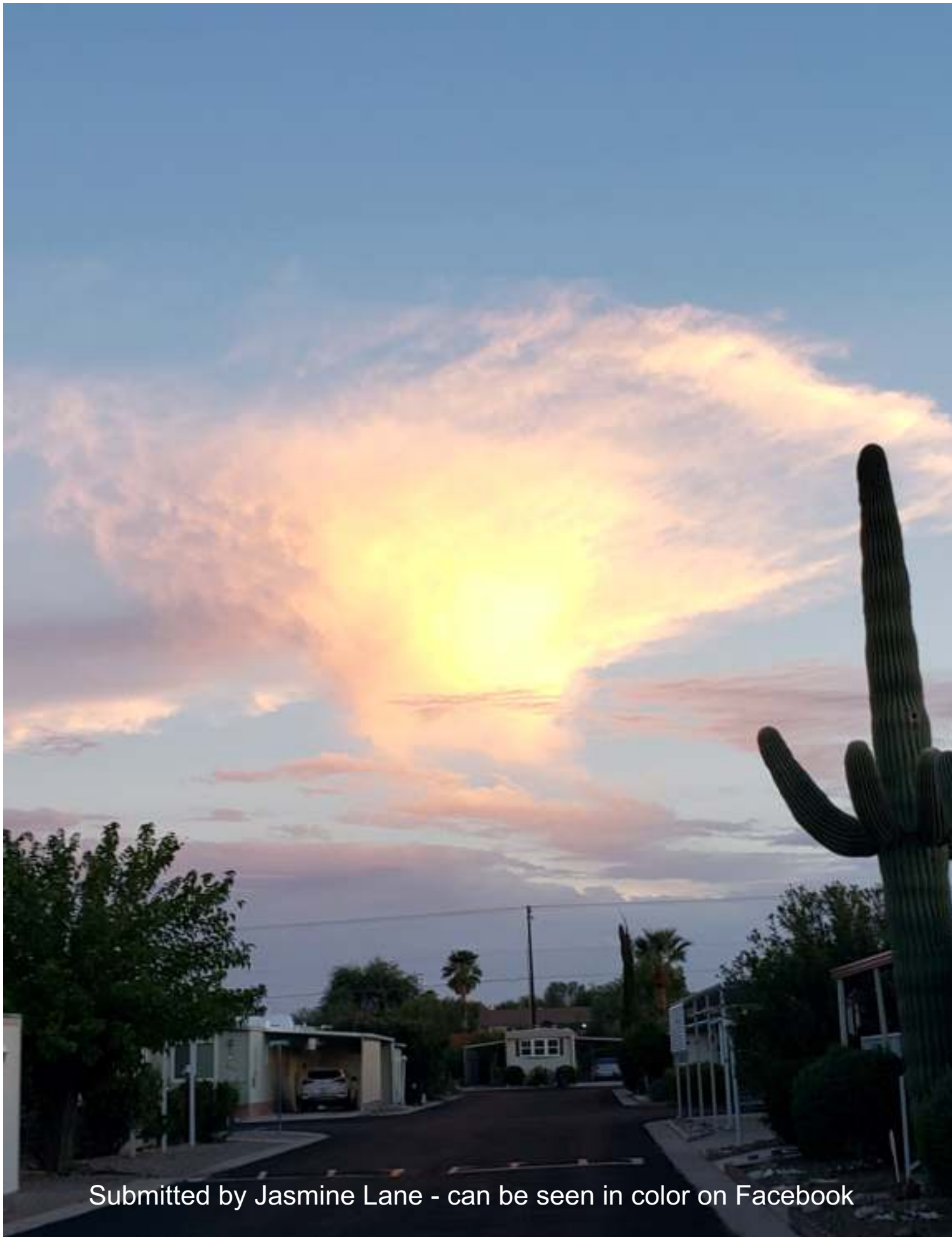
Submitted by Jasmine Lane - can be seen in color on Facebook