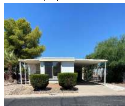
Lot 338 2 Bed/2 Bath $17,999.00