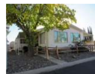
# 284 SOLD