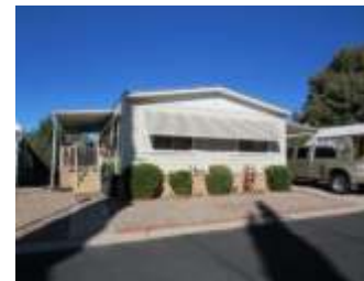
# 95 SOLD