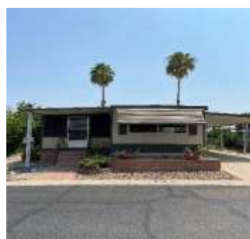
Lot 155 2 Bed/1 Bath $24,900.00